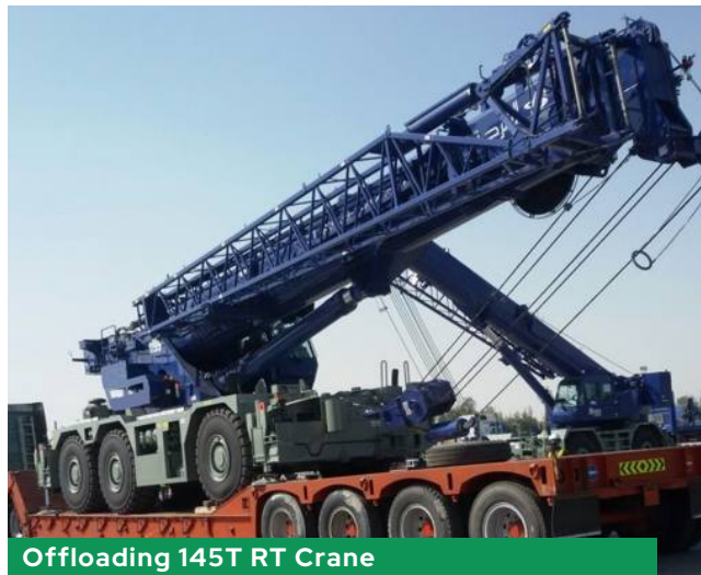
Offloading 145T RT Crane