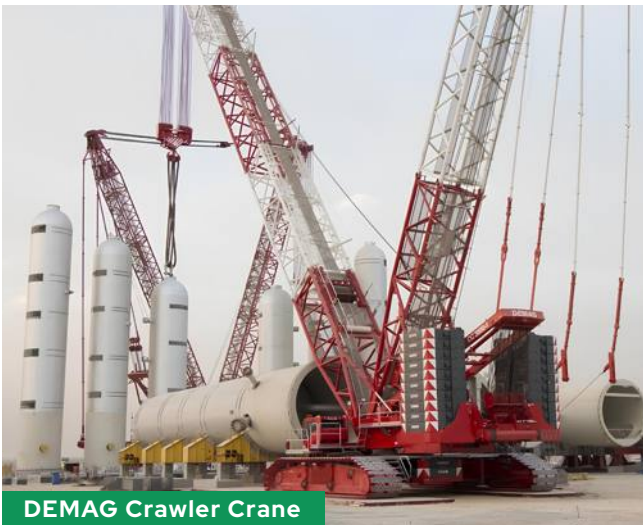
DEMAG Crawler Crane

Our comprehensive Logistics Services encompass a spectrum of specialized offerings, including Rig Moves, Heavy Lifting, Warehousing, Transportation, and Supply Chain Management. From intricate rig relocations to seamless heavy lifting operations, we provide tailored solutions to meet diverse logistical needs, ensuring efficiency, safety, and client satisfaction in every aspect of our service portfolio.